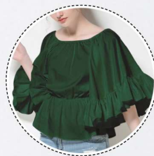
WEARING STYLE-2 Round Neck