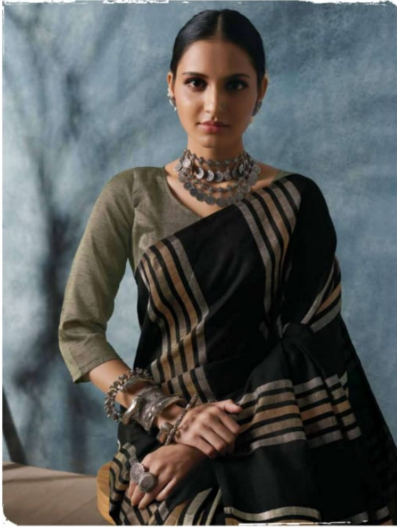
AN AFFAIR TO REMEMBER