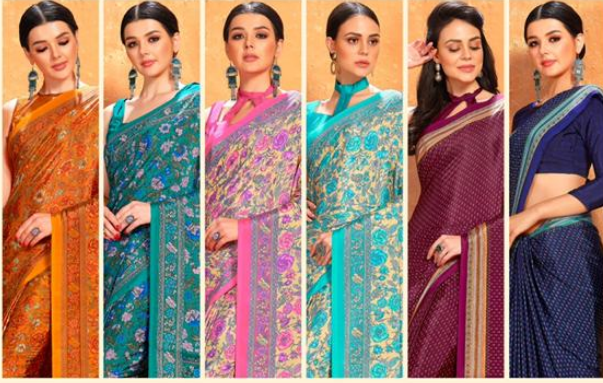
8201 A 8201 B 8202 A 8202 B 8203 A 8203 B