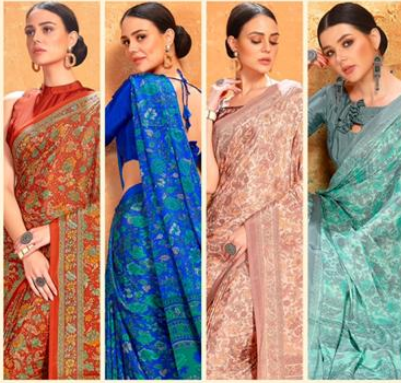
8207 A 8207 B 8208 A 8208 B