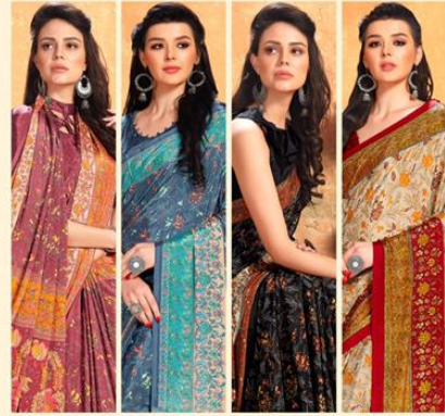
8209 A 8209 B 8210 A 8210 B