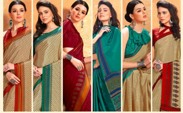
8204 A 8204 B 8205 A 8205 B 8206 A 8206 B