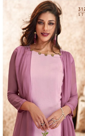
312 STYLE FOCUS