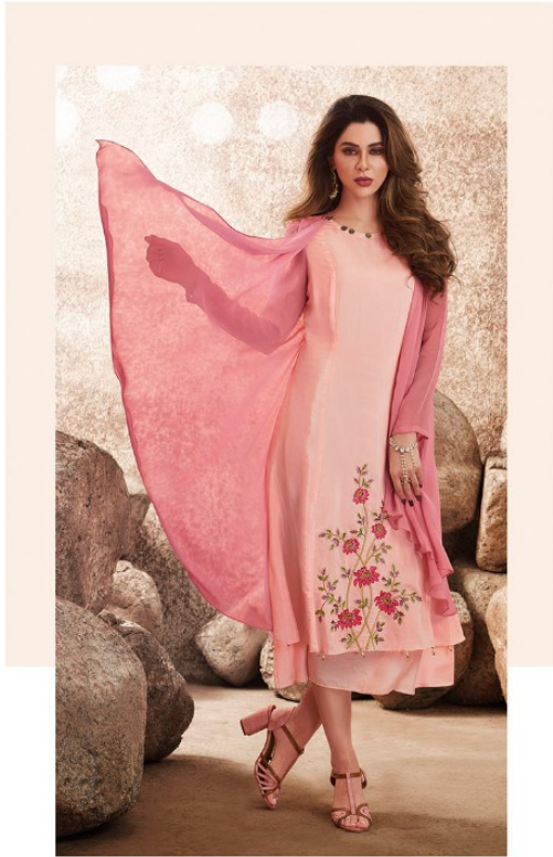
309 CONFORMING TO GOOD TASTE