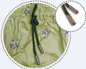
Elastic Band with Metal Tip Drawstring