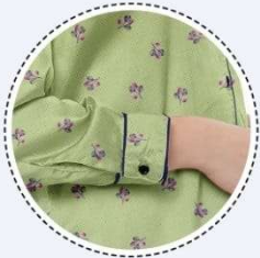
Shirt Style Cuff with Button