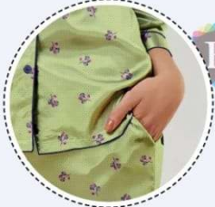
Piping on Shirt Bottom and One Side Pocket