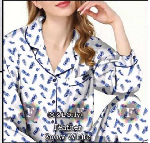
(M & L Only) Feather Snow White