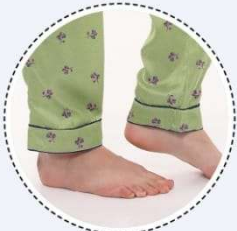
Double Piping Bottom