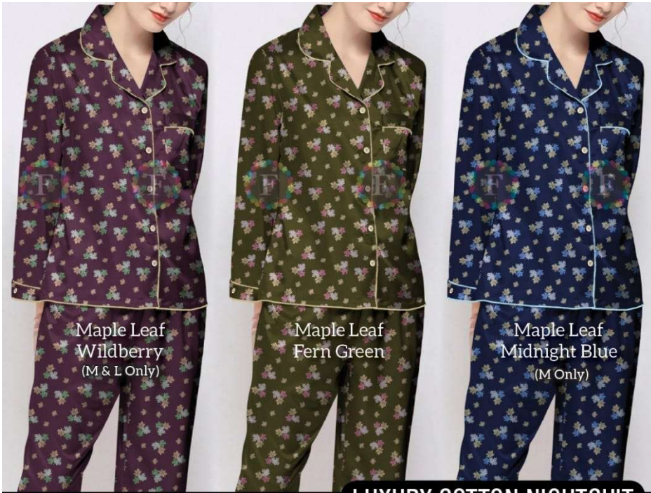
Maple Leaf Wildberry (M & L Only)