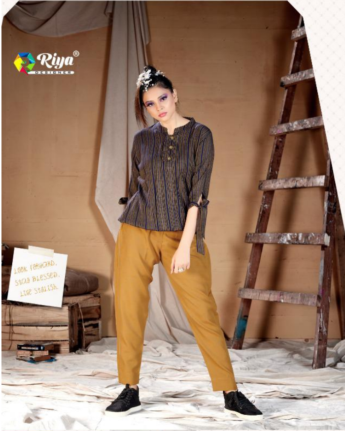
Style personality code 3003 Talking the Imagination Beyond Usual Colour Combination, this Suit Gives You Cozy & Beautiful Look in All The Urban of Shoulder...