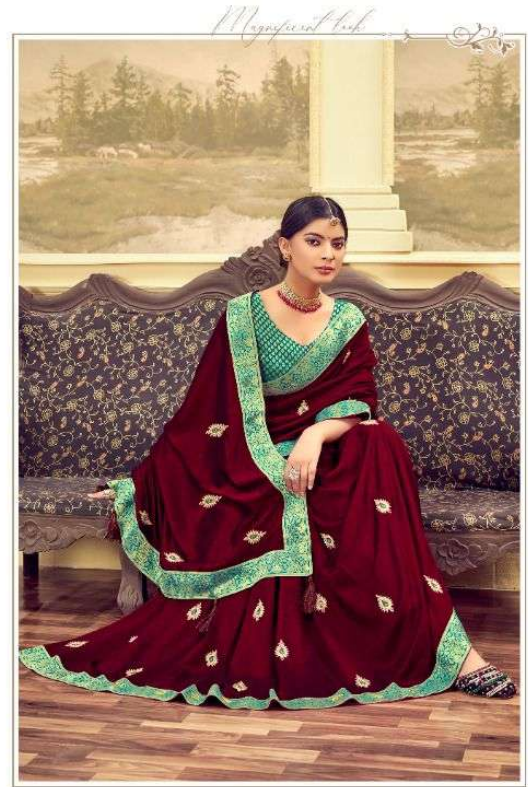
BLOOMING WINE VICHITRA SILK SAREE WITH EMBROIDERED BUTTIES AND SWAROVSKI HAVING BROCADE BORDER WITH SWAROVSKI WORK AND TUSSELS. PAIRED WITH RAKA SHIGADEE BLOUSE