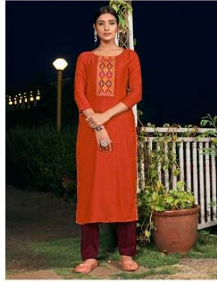
{ 3.3.6.2 }