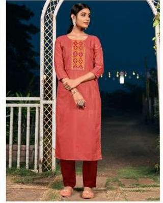
{ 3.3.6.6 }