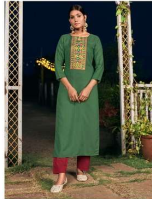
{ 3.3.6.7 }