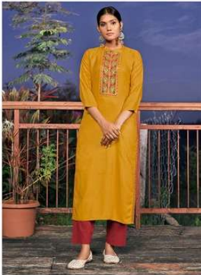
{ 3.3.6.3 }