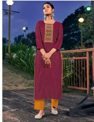
{ 3.3.6.4 }