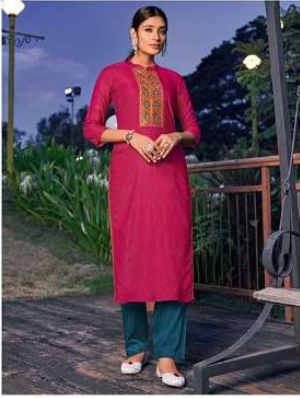
{ 3.3.6.1 }