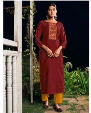
{ 3.3.6.8 }