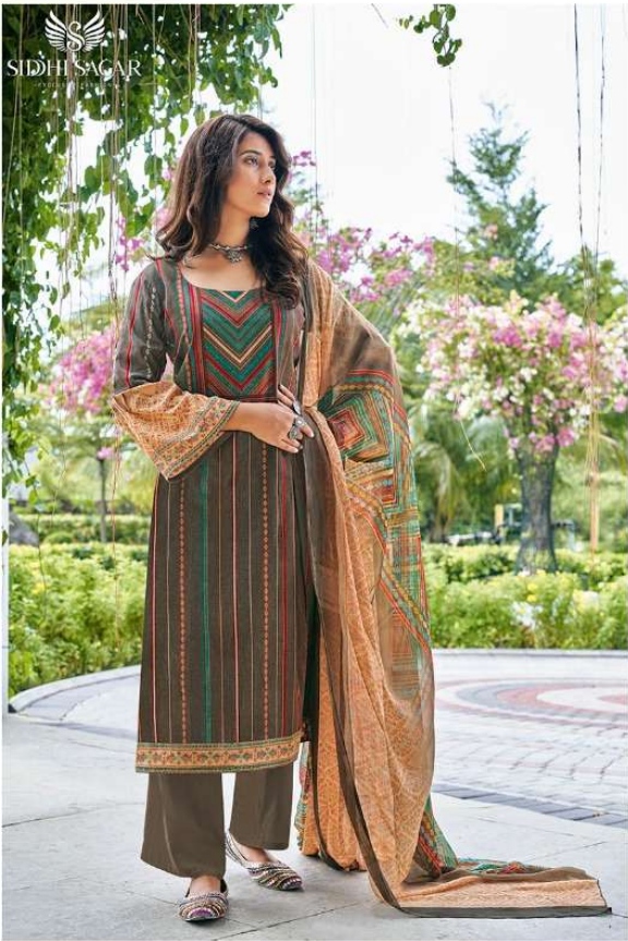
LUXE FABRICS, BOLD PATTERNS & SUMPTUOUS DETAILING ADORN MODERN SILHOUETTES