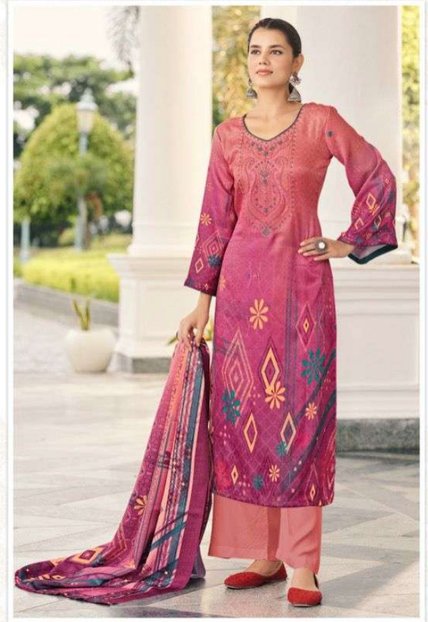
■ 4102 ■ A blissful balance of Indian & contemporary aesthetics. SHEER BLISS