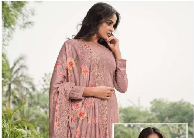
■ This season's blooming pieces for a radiant you!