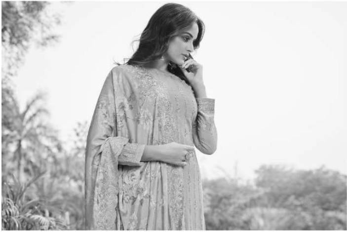
■ Bloom in florals this festive season with our most graceful separates.