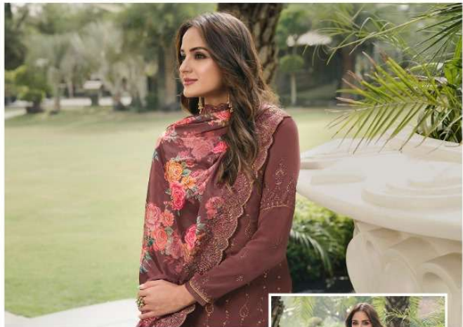
Hit refresh on your style with embroidered suit & print dupatta.