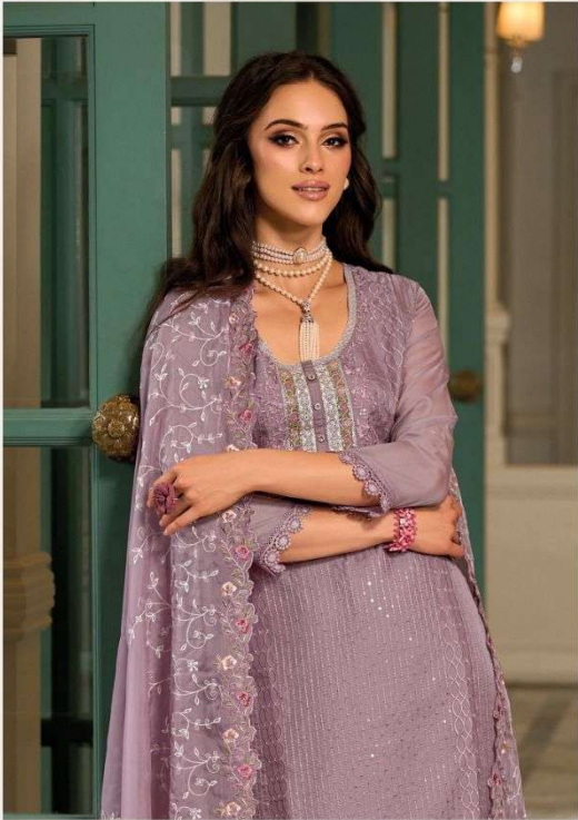
Classic A GIRL SHOULD BE TWO THINGS: CLASSY AND FABULOUS