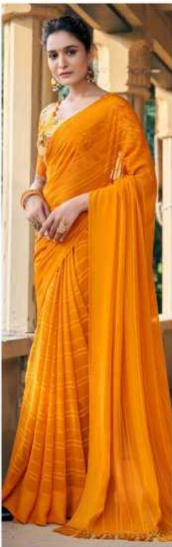
D.no. - 4006