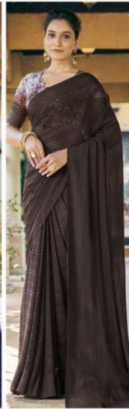
D.no. - 4004