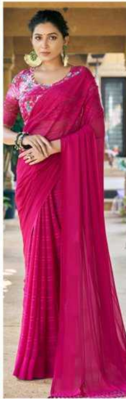
D.no. - 4002