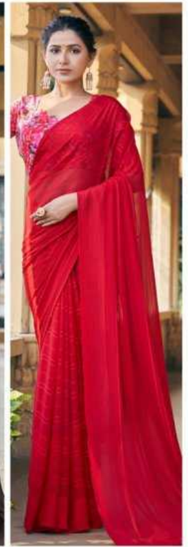
D.no. - 4005