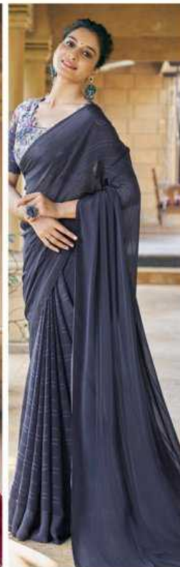
D.no. - 4009