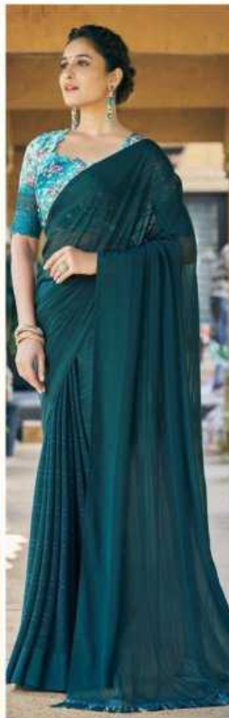
D.no. - 4007