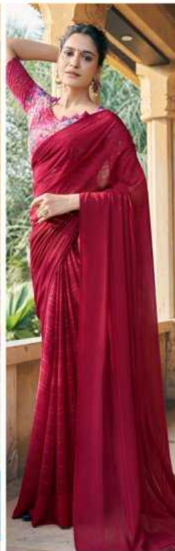
D.no. - 4008