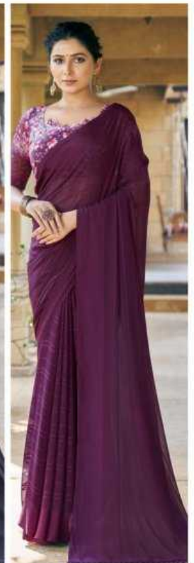
D.no. - 4010