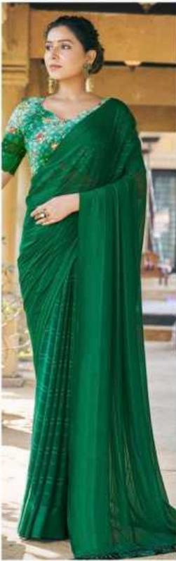
D.no. - 4001