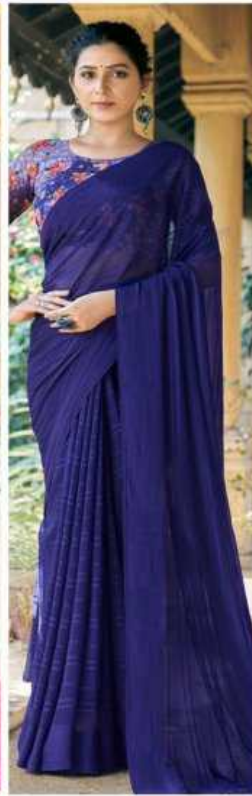
D.no. - 4003