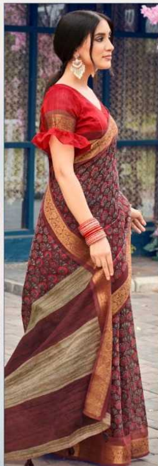
D.NO - 73007