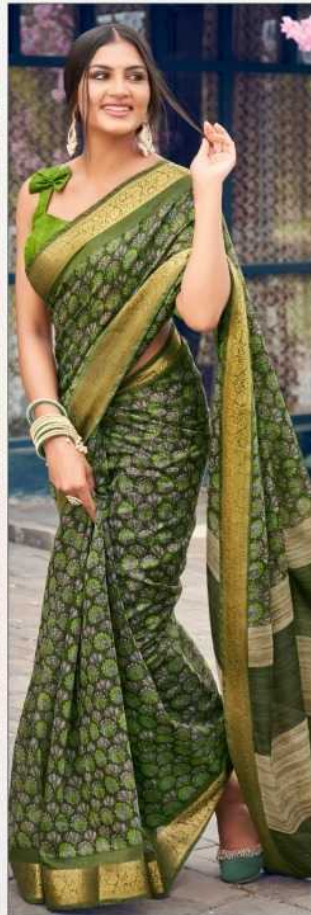
D.NO - 73003