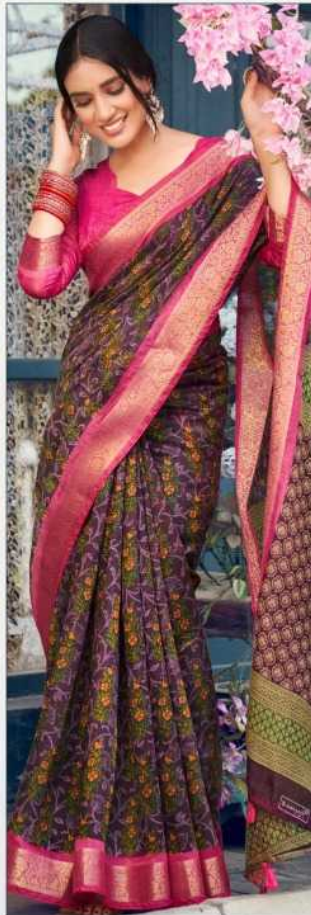
D.NO - 73002