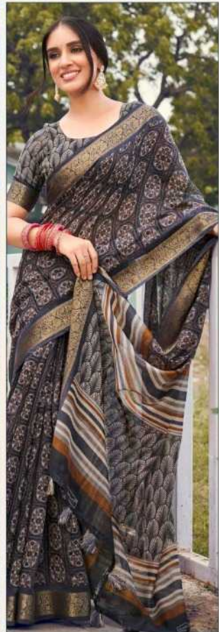
D.NO - 73004