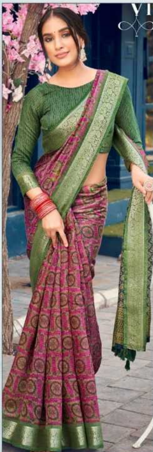
D.NO - 73005