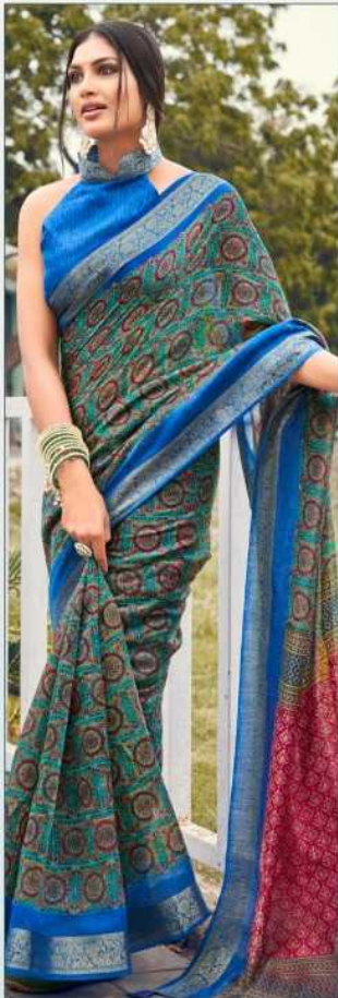
D.NO - 73001