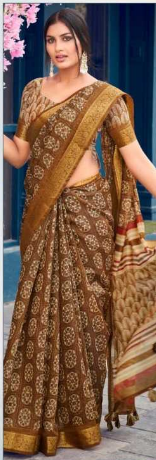
D.NO - 73006