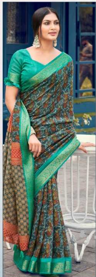
D.NO - 73008