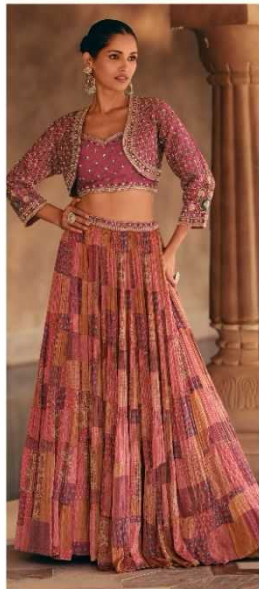
CODE - 5392