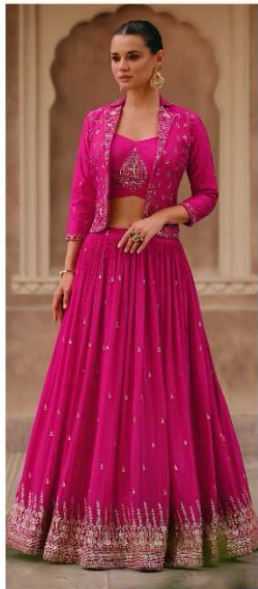
CODE - 5391