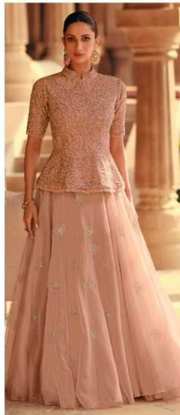
CODE - 5393