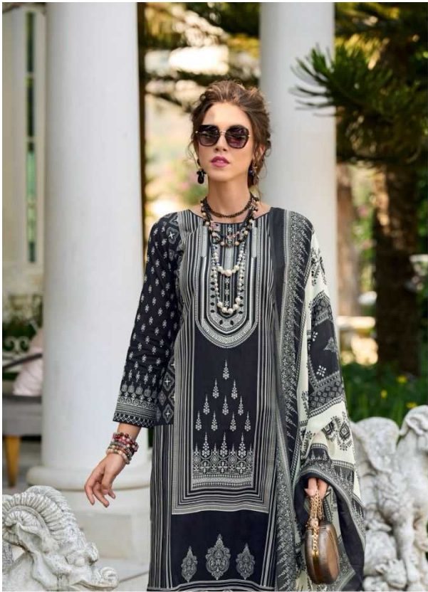
SHE CAN BEAT ME, BUT SHE CANNOT BEAT MY OUTFIT