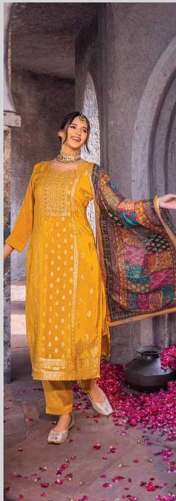
DASTOOR 3624 Volume 7