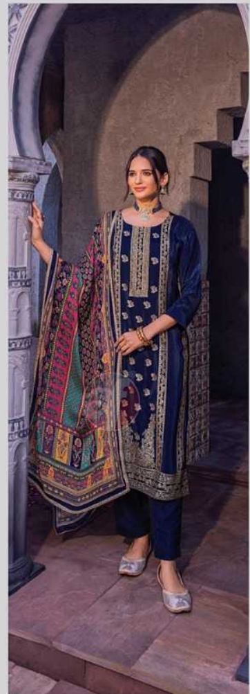
DASTOOR 3623 Volume 5