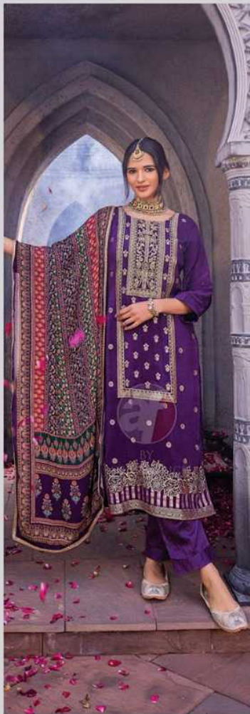
DASTOOR 3621 Volume 5