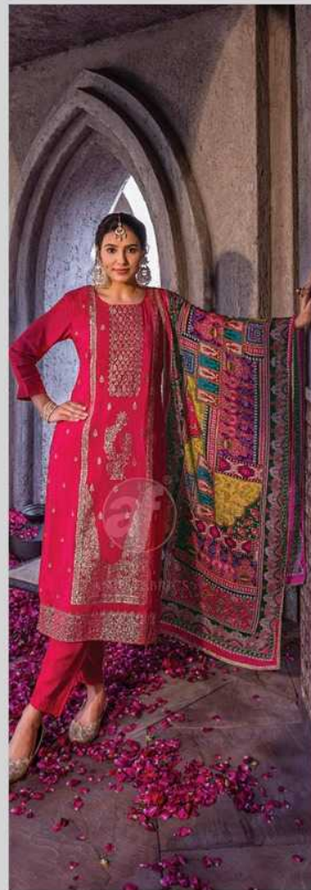
DASTOOR 3625 Volume 7