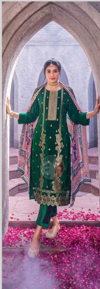
DASTOOR 3622 Volume 5