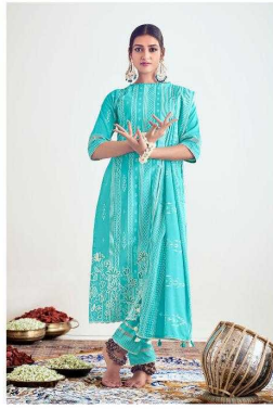
LOOK | 8922