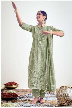
LOOK | 8921