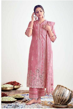
LOOK | 8923