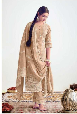
LOOK | 8924