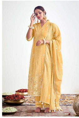
LOOK | 8925