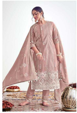
LOOK | 8926