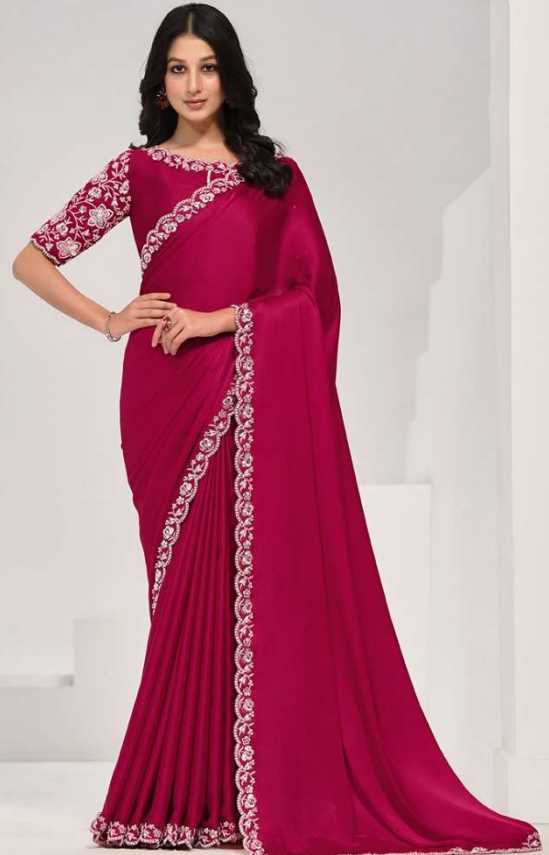
43908 FABRIC : Crape Satin Silk