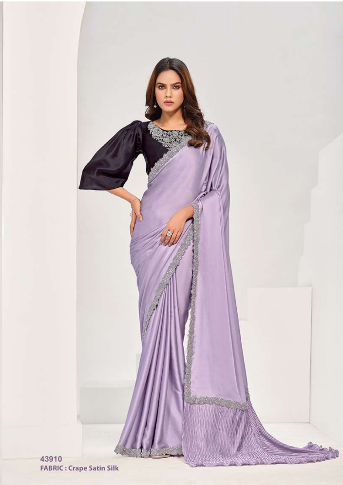
43910 FABRIC : Crape Satin Silk