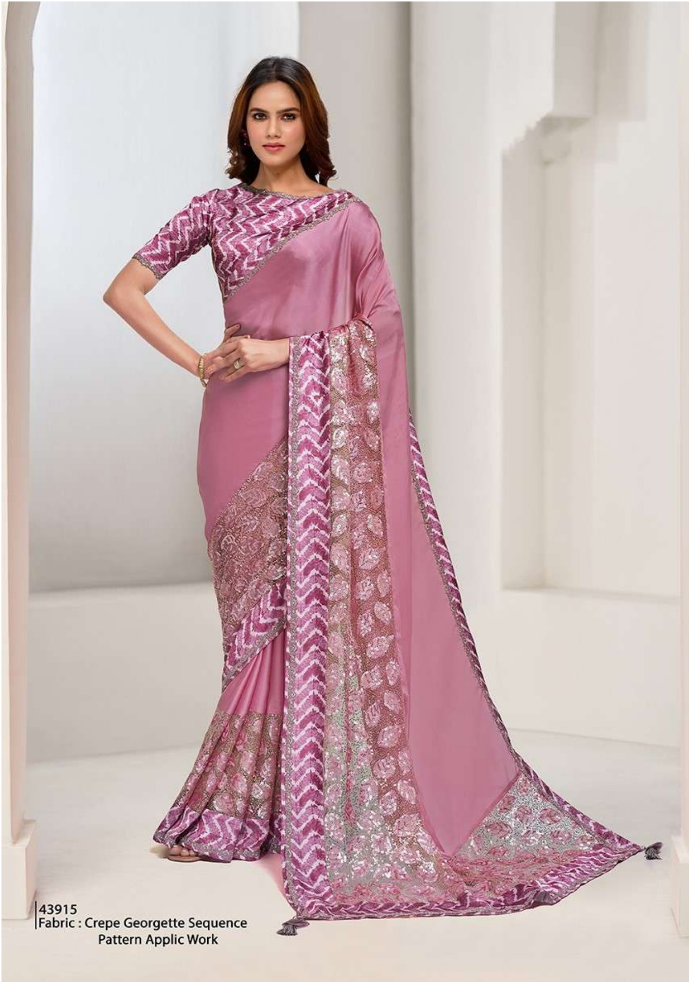
43915 Fabric : Crepe Georgette Sequence Pattern Applic Work