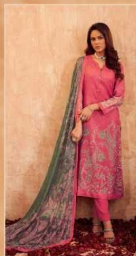
NIRAN | 1005