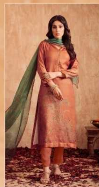
NIRAN | 1007