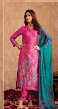
NIRAN | 1008

Let the rich hue of elevate your style & make you stand out |