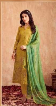
NIRAN | 1001