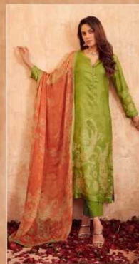
NIRAN | 1004