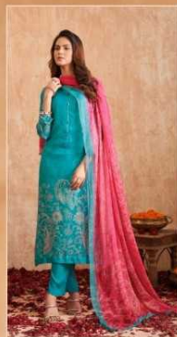
NIRAN | 1003