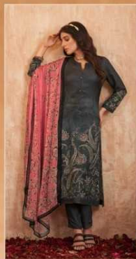
NIRAN | 1002