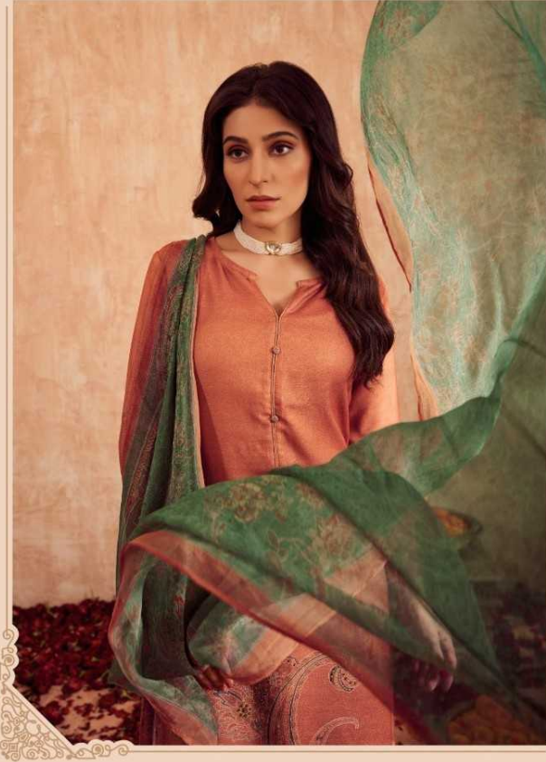
NIRAN | 1007

Experience the Legacy of Our Ancestors. Through Kuris. That Weave Tradition into Every Fiber. Creating a Seamless Blend of Cultural Richness and Modern Sophistication