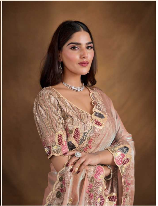
◆◆◆ 24712 Fabric: Two tone Satin Silk Blouse : Hand Work Embroidered