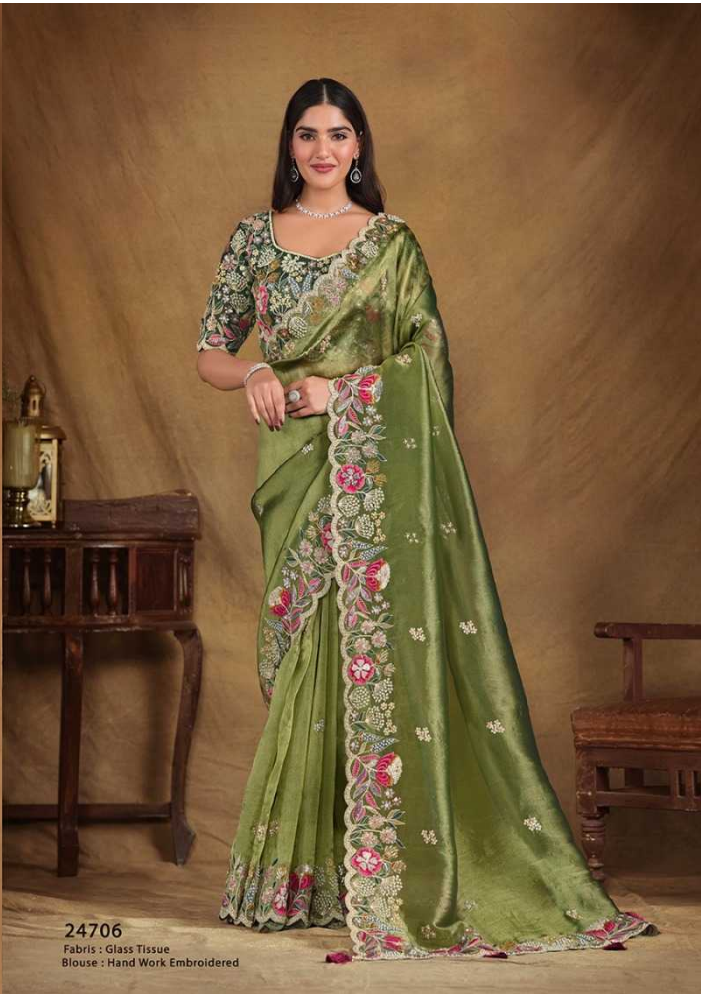
24706 Fabric : Glass Tissue Blouse : Hand Work Embroidered