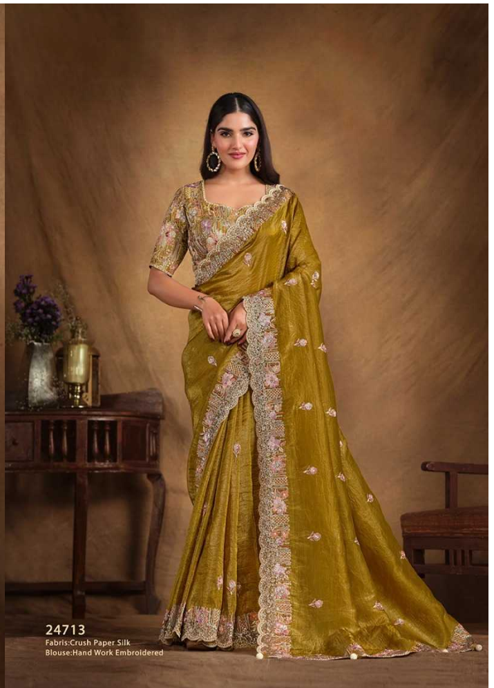
24713 Fabric:Crush Paper Silk Blouse:Hand Work Embroidered