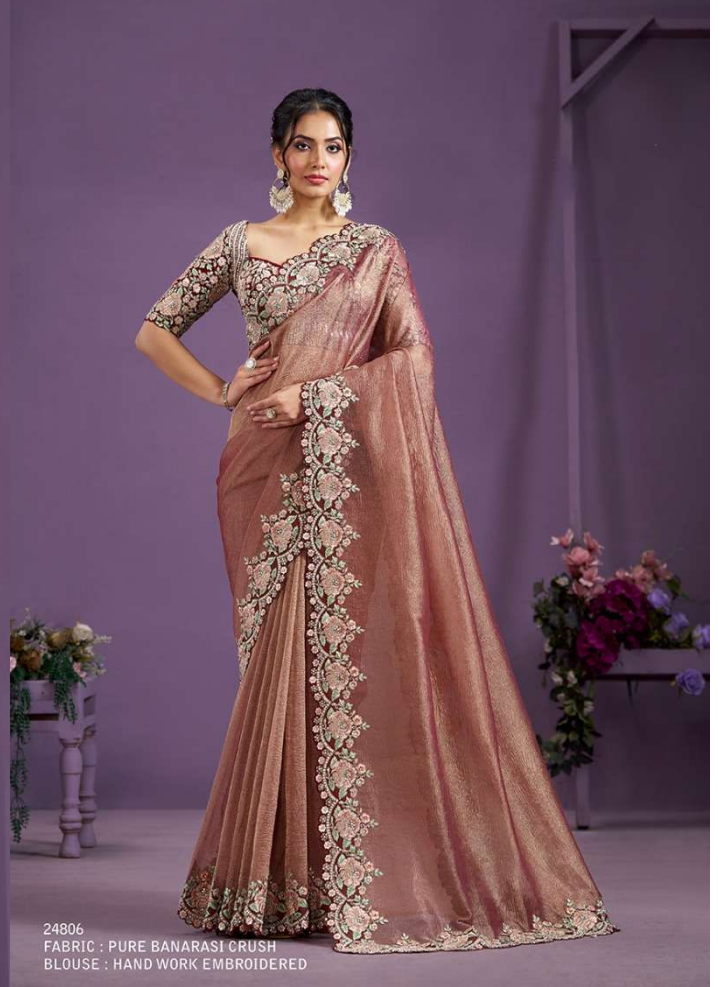
24806 FABRIC : PURE BANARASI CRUSH BLOUSE : HAND WORK EMBROIDERED