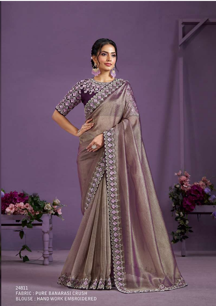
24811 FABRIC : PURE BANARASI CRUSH BLOUSE : HAND WORK EMBROIDERED