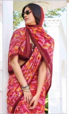
80813 (With stone work)