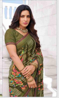
80810 (With stone work)