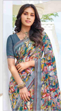
80811 (With stone work)