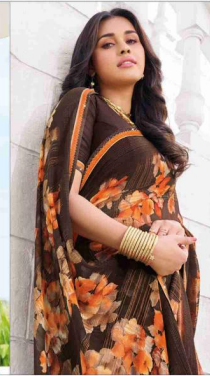
80812 (With stone work)