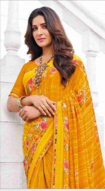
80804 (With stone work)