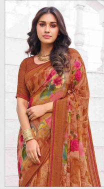
80808 (With stone work)