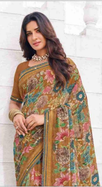
80806 (With stone work)