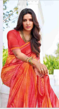
80803 (With stone work)