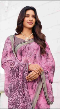
80807 (With stone work)