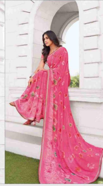
80809 (With stone work)