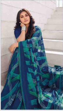
80802 (With stone work)