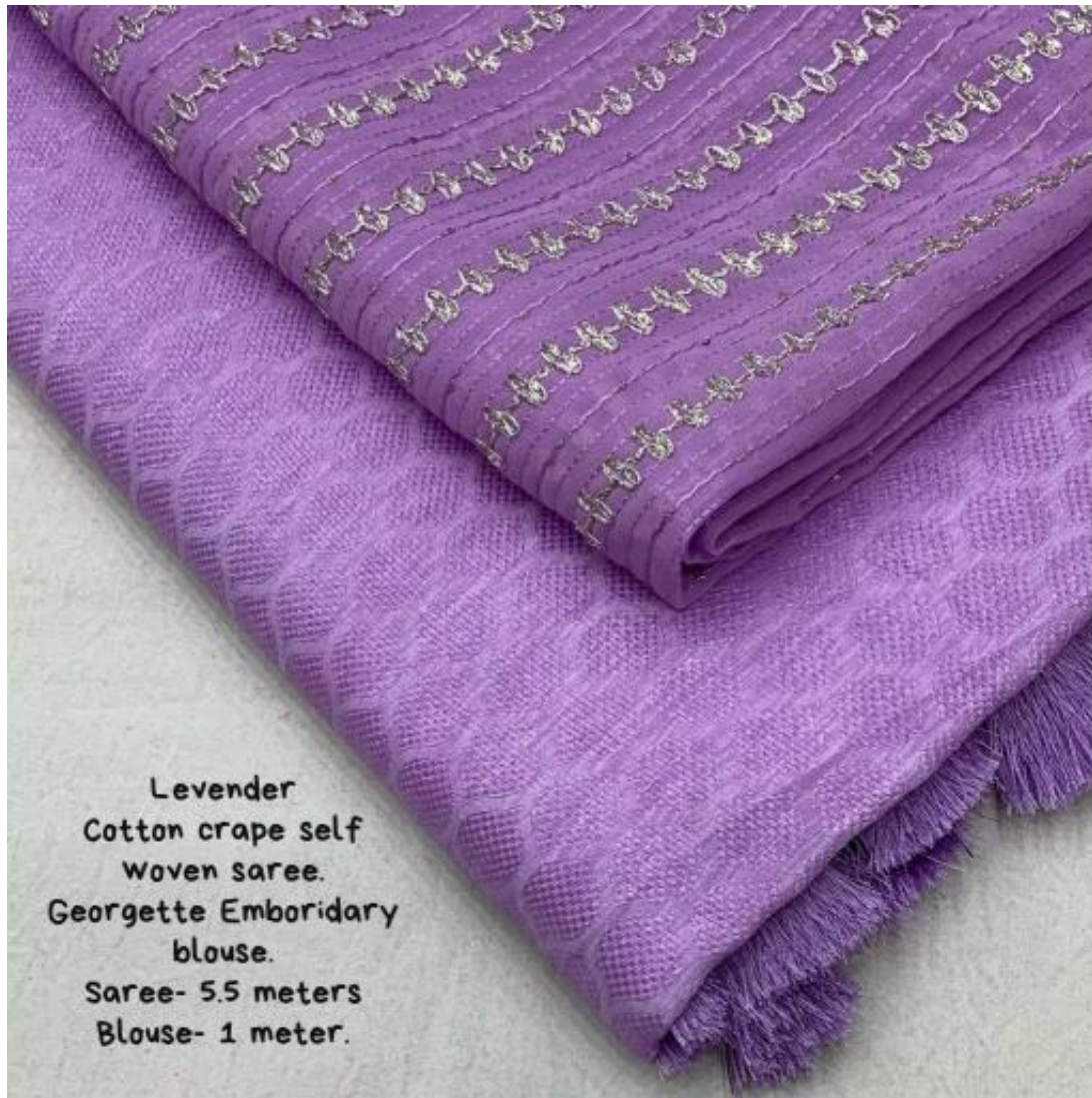
Levender Cotton crape self woven saree. Georgette Emboridary blouse. Saree- 5.5 meters Blouse- 1 meter.