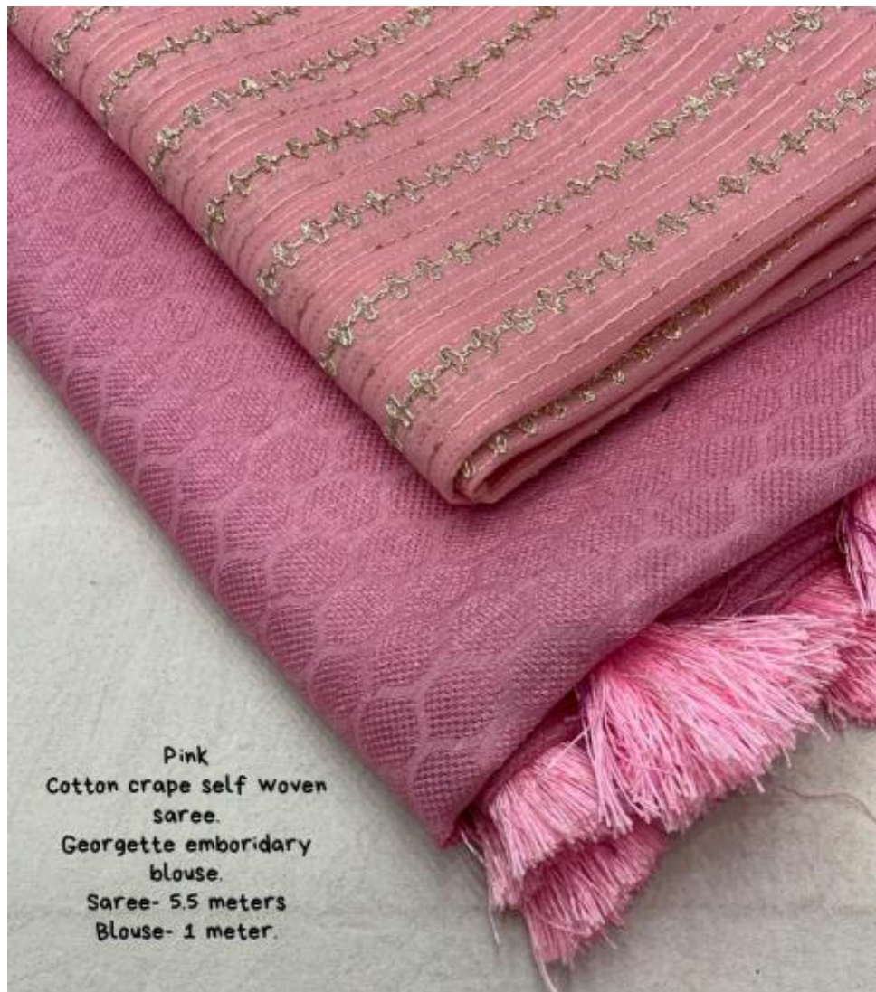
Pink Cotton crape self woven saree. Georgette embroidery blouse. Saree- 5.5 meters Blouse- 1 meter.