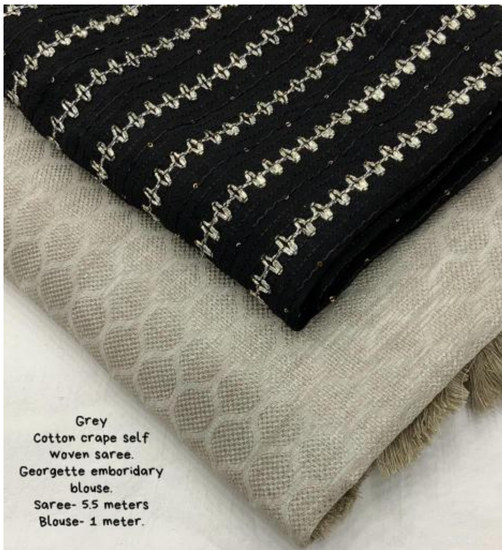
Grey Cotton crape self woven saree. Georgette embroidery blouse. Saree- 5.5 meters Blouse- 1 meter.