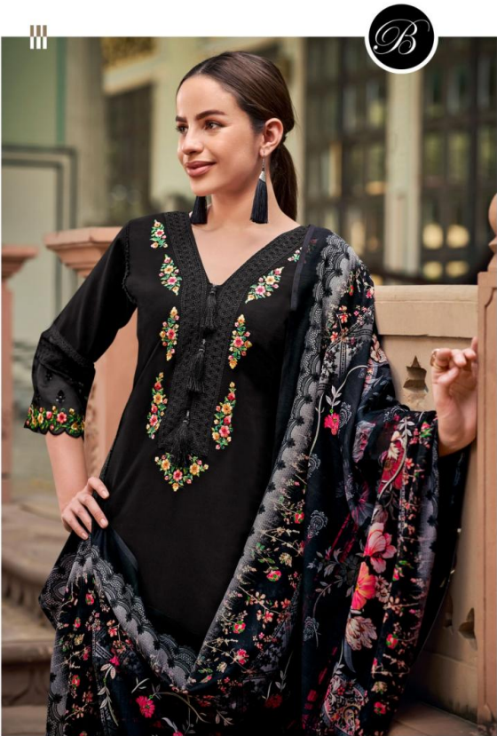
Matchless style, amazing work details and a dash of tradition; what else you need to flaunt on this festive season? ~ 821-003