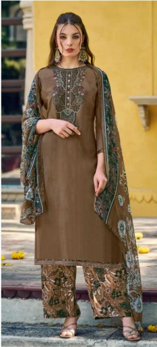
◆ 879-001 ◆