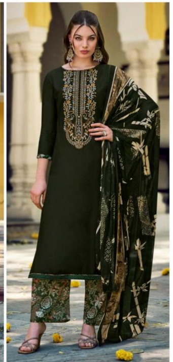
◆ 879-008 ◆