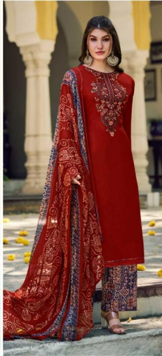
◆ 879-002 ◆