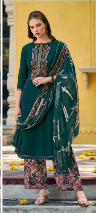
◆ 879-003 ◆