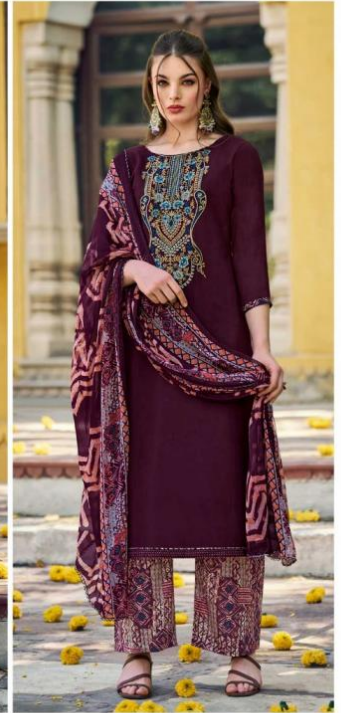
◆ 879-004 ◆