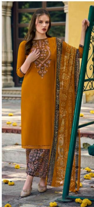
◆ 879-006 ◆