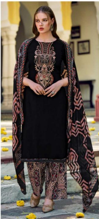
◆ 879-005 ◆