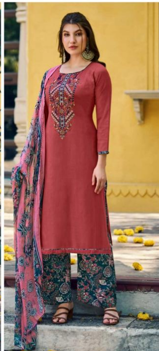
◆ 879-007 ◆