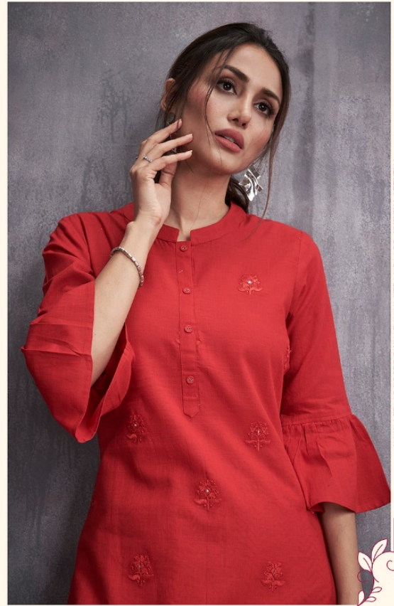
KURTA: COTTON SLUR WITH COMPUTER EMBROIDERY PALAZZO PANTS: COTTON TILIA WITH ETHNIC BLOCK STYLE PRINT