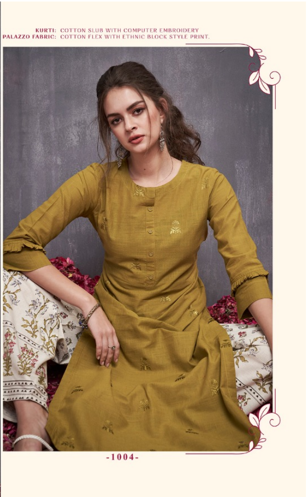
KURTI: COTTON SLUB WITH COMPUTER EMBROIDERY PALAZZO FABRIC: COTTON FLEX WITH ETHNIC BLOCK STYLE PRINT.