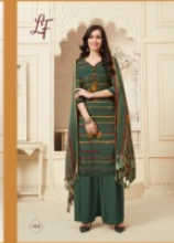
D.NO. 4106 ▶