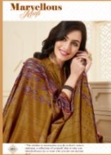
D.NO. 4101 ▶