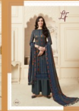
D.NO. 4102 ▶