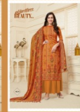
D.NO. 4104 ▶