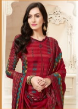
D.NO. 4105 ▶