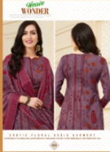
D.NO. 4103 ▶