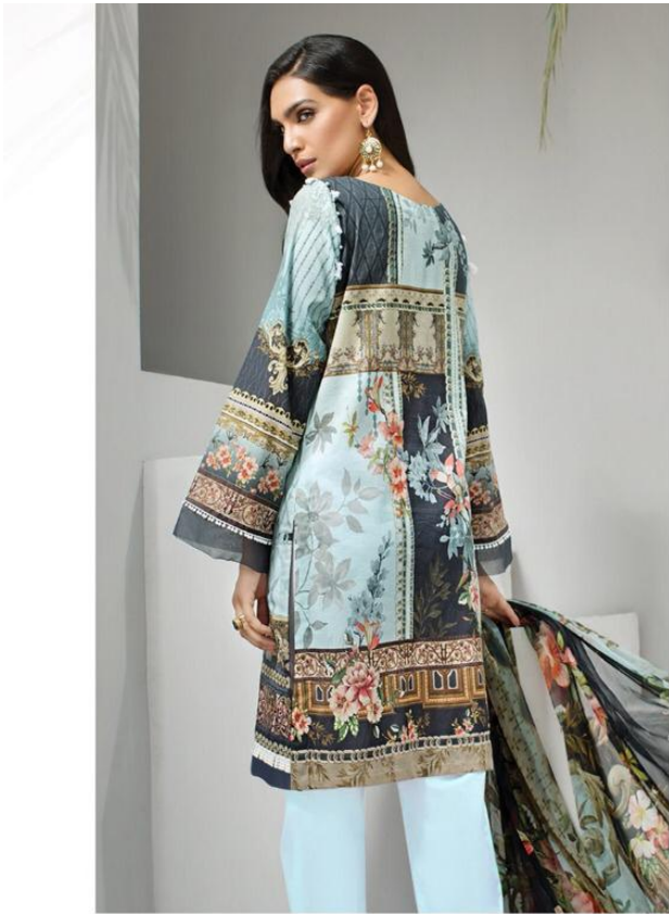
2004 AQUA AZURE