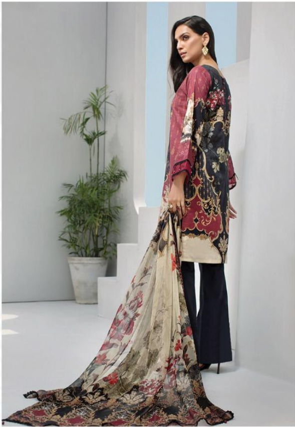
2001 TURKISH TALE