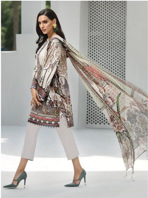
2002 GYPSY FLEUR