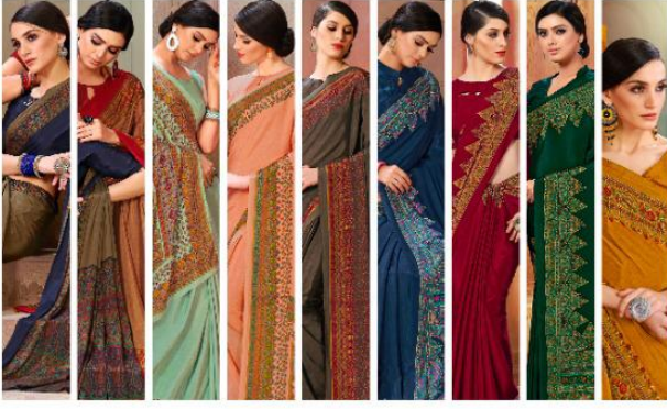
8601A 8601B 8602A 8602B 8602C 8603A 8603B 8603C 8604A