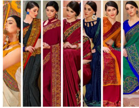
8612C 8613A 8613B 8614A 8614B 8615A 8615B