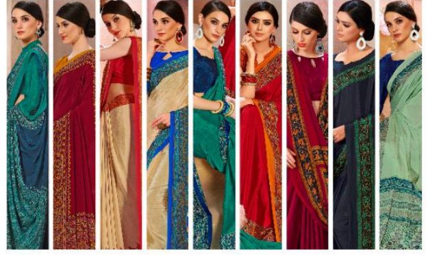
8604B 8604C 8605A 8605B 8606A 8606B 8607A 8607B 8608A