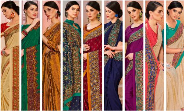
8608B 8609A 8609B 8610A 8610B 8611A 8611B 8612A 8612B