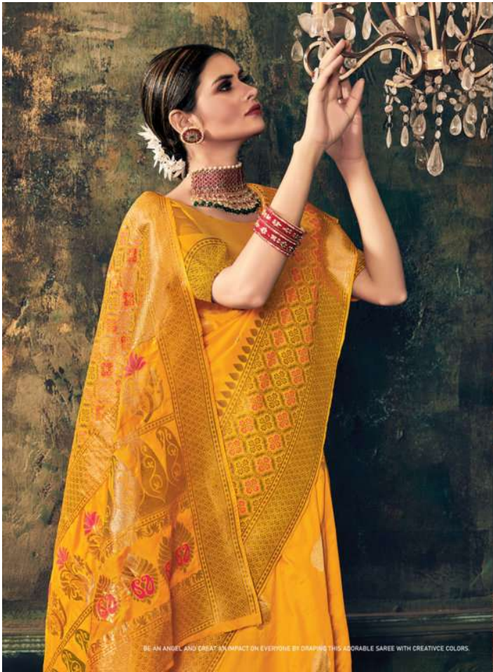
BE AN ANGEL AND CREATE AN IMPACT ON EVERYONE BY DRAPING THIS ADORABLE SAREE WITH CREATIVE COLORS.