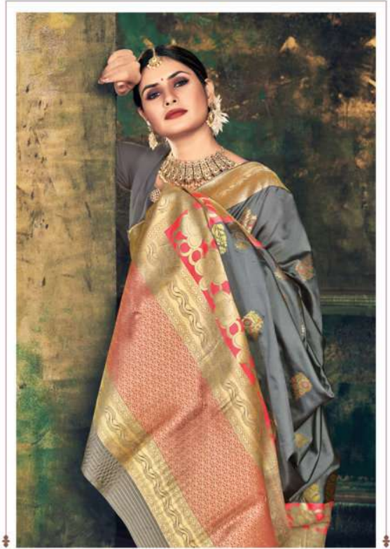
REVEAL YOUR STYLE WITH THIS HIGHLY ADORNED SAREE CREATED FOR THAT SPECIAL SUMMER OCCASION