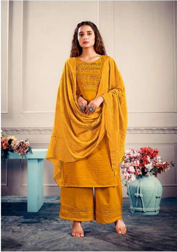
D.no . 1002