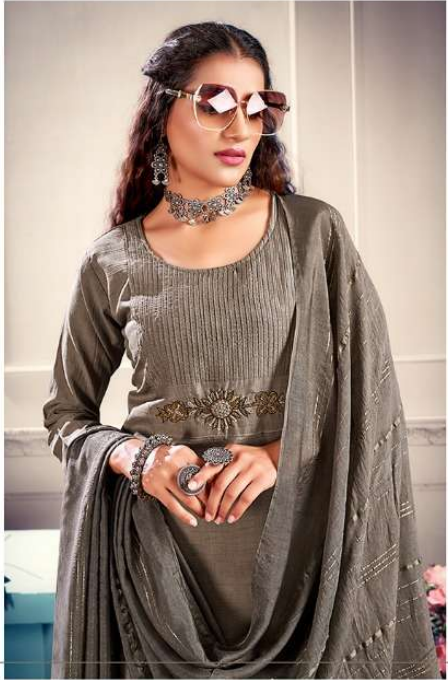
D.no . 1001